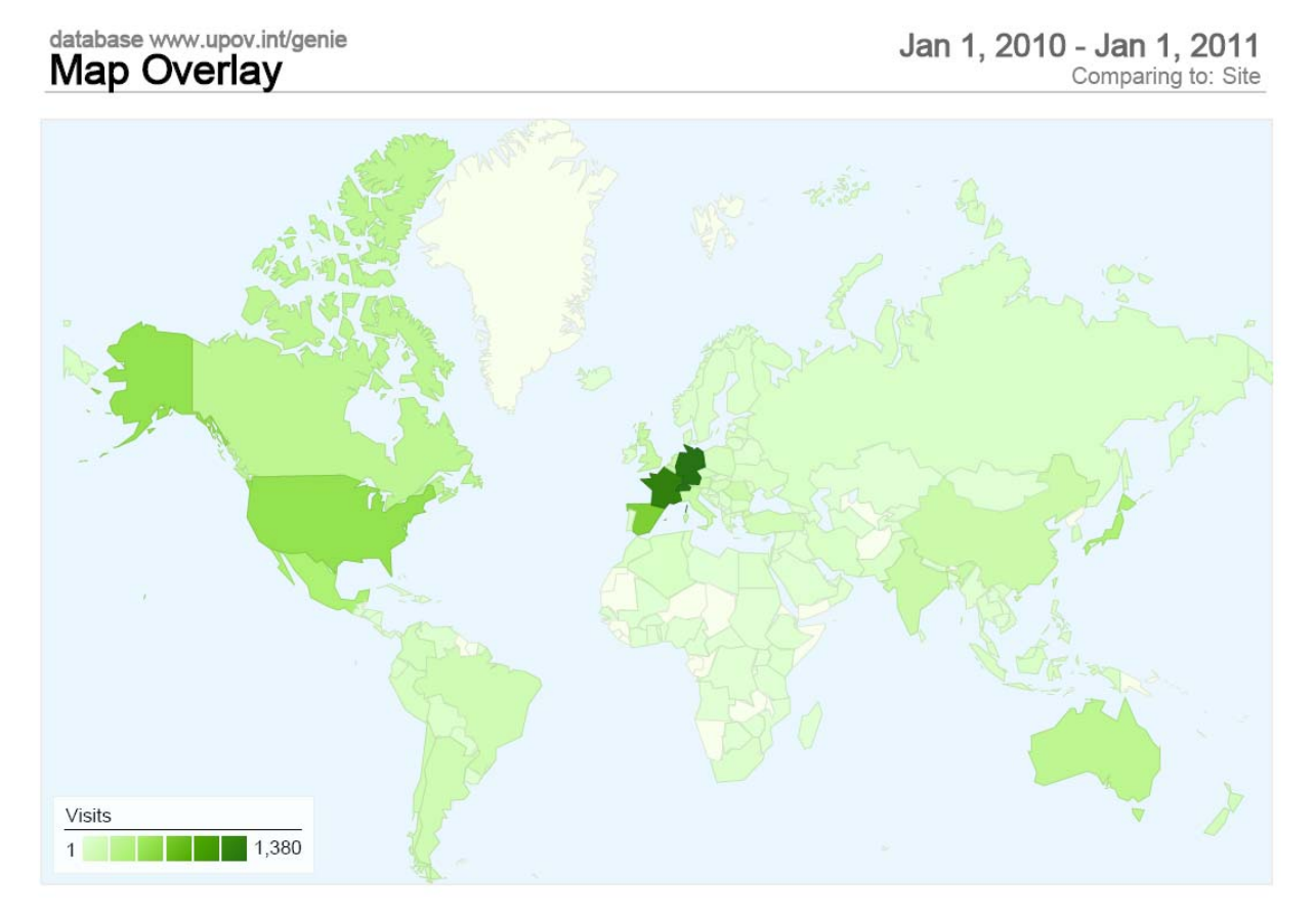
10,738 visits came from 151 countries/territories

(*) Date of launch of GENIE database on freely accessible area of UPOV website.