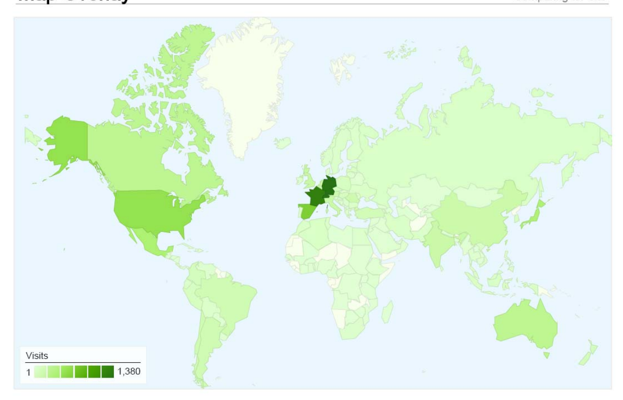
10,738 visits came from 151 countries/territories

Jan 1, 2010 - Jan 1, 2011 Comparing to: Site