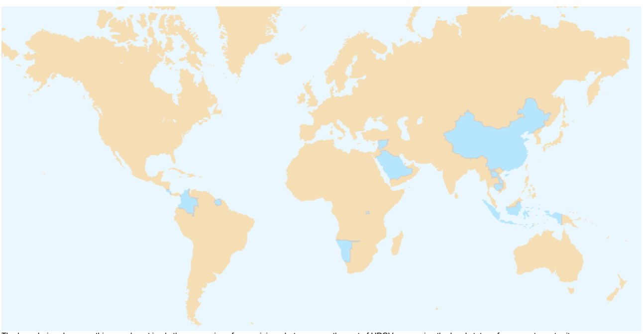
Figure 3 - Status in relation to UPOV during the first nine months of 2024

The boundaries shown on this map do not imply the expression of any opinion whatsoever on the part of UPOV concerning the legal status of any country or territory.