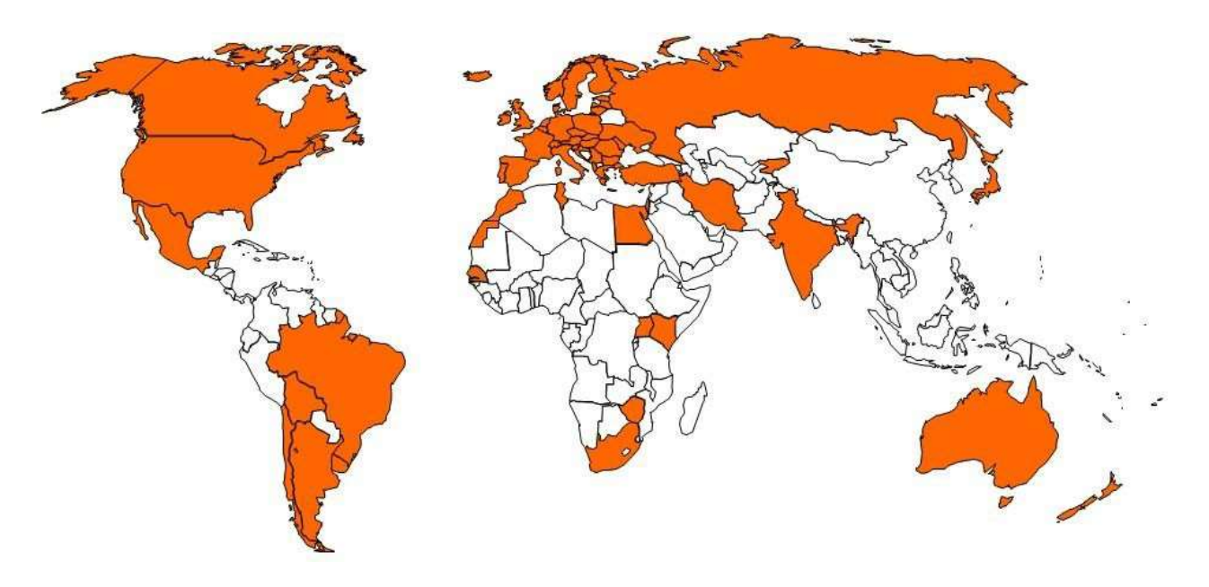
Figure 1 Map of Participating Countries in the OECD Seed Schemes (2016)